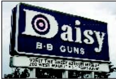
Commemorative Sign at Daisy Facility