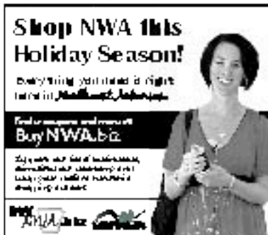
BuyNWA.biz Print Advertising