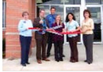
NWA Chiropractic 2102 W. Pleasant Grove Rd., Rogers