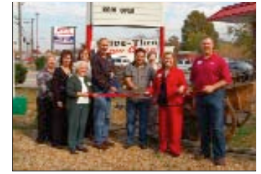
King Burrito & Taqueria 903 S. Eighth St., Rogers