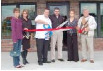
Lowell Pharmacy 107-C S. Lincoln St., Lowell