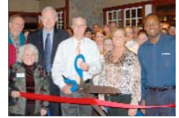
Red Lobster 1704 S. 46th St., Rogers