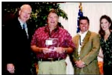
Honoring Small Business of the Year: Garner Building Supply