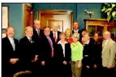
Washington D.C. Fly-in