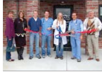
Ozark Urgent Care 114 Harrison Ave., Ste. B