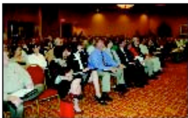
Job Fair Seminar