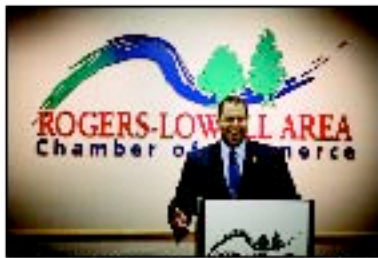
United States Ombudsman 2008