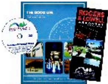
Regional Relocation Information