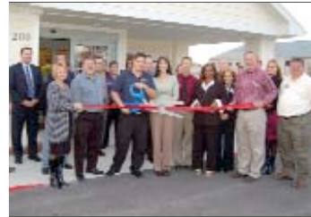
Suburban Extended Stay Hotel 200 SW Suburban Ln., Bentonville