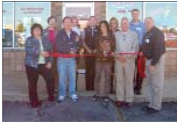
Sew Good Dry Cleaners 4408 W. Walnut St., Ste. 9, Rogers