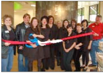
Brieshi Salon 2203 Pinnacle Hills Promenade, Rogers