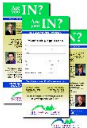
'Are You In' Supplier Brochures