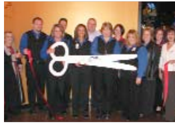
Choctaw Casino 3400 Choctaw Road, Pocola