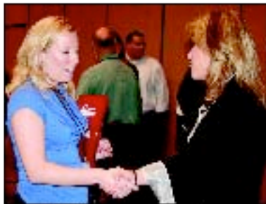
Mingling at Small Business Conference