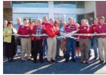
First Federal Bank-Lowell 225 N. Bloomington St., Lowell