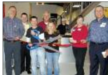
Shake This 1607 Empire St., Lowell