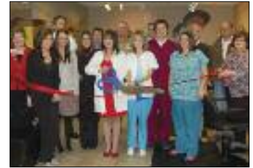
Heavenly Salon & Day Spa 3105 NE 11th St., Bentonville