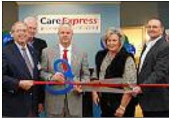
Care Express Clinic 4208 Pleasant Crossing, Rogers