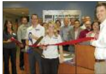
Maximum Performance Chiropractic 5430 Pinnacle Point Dr., Rogers