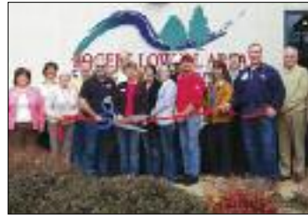
Corr-Designs 14100 Eastgate Dr., Rogers