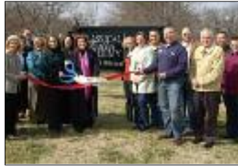
Classical Ballet Academy 1106 NW 10 St., Bentonville