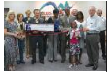
My C.A.S.E. Pro, LLC 9653 Nation Dr., Springdale