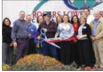
Abshier Construction 908 E. Central Ave., Bentonville