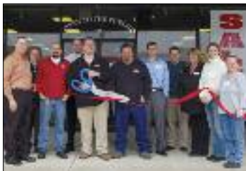
NWA Restaurant & Kitchen Supply 5240 W. Sunset Ave., Springdale