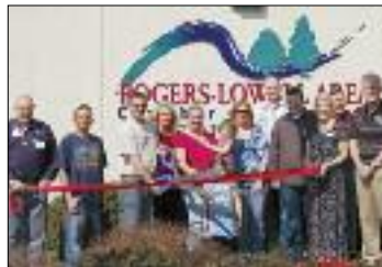
Residential Concrete LLC Rogers