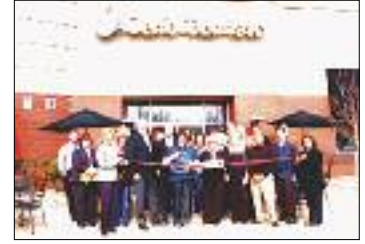
Cafe Baristo 5411 Pinnacle Point Dr., Rogers