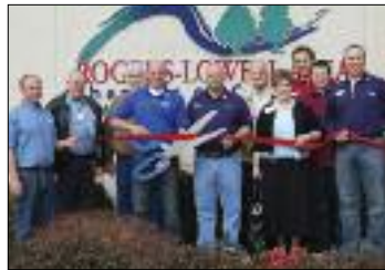
Loreto Homes Bentonville