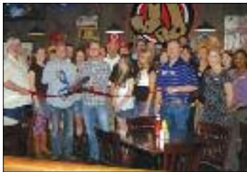
JJ's Grill and Chill 4500 W. Walnut St., Rogers