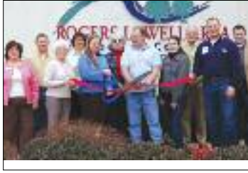
AZZ Lawn Care & Landscaping, LLC 10844 Oak St., Garfield