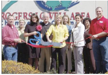
3W Magazine Rogers