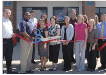
American Cancer Society 3291 S.Thompson St., Springdale