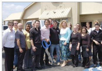
Napoli's 2119 W.Walnut St., Rogers