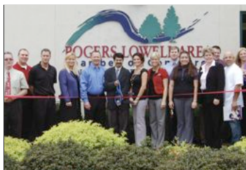
March of Dimes 3291 S.Thompson St., Springdale