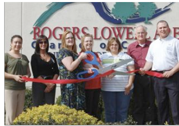
Celebrating Home Centerton