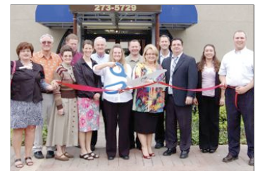
ZuZu's Petals & Gifts 5206 Village Pkwy., Rogers