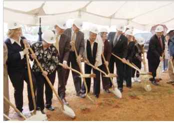
Adult Development Center N. 24th Street, Rogers