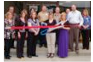
Cheryl and Company: A Salon 3277 W. Sunset Ave., Springdale