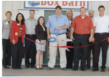
The Box Barn 721 N. Second St., Rogers