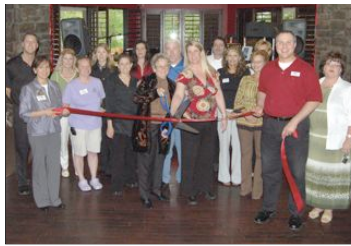
Boomers Time Out 3607 SE Metro Pkwy., Bentonville