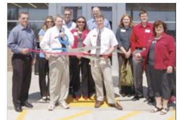
Kum & Go Lowell 816 W. Monroe St., Lowell