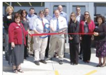
Kum & Go Bentonville 3610 SW Regional Airport Blvd.