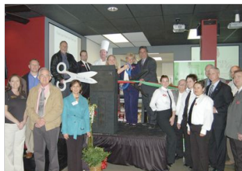
Cuisines Catering 1001 S. 52nd St., Rogers