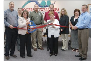
Atwood Design Bentonville