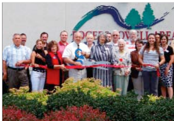
Lightfoot Consulting 15595 Lakeview Dr., Lowell