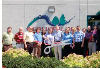
Moran IT Fayetteville