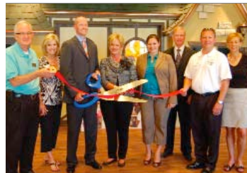
Little Sunshine's Playhouse & Preschool 3468 W. Pleasant Grove Rd., Rogers