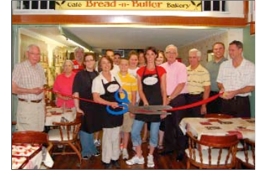
Bread N Butter Baking Cafe 113 W. Walnut St., Rogers