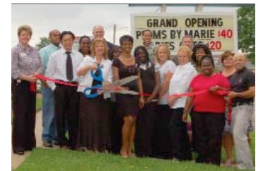
Salon Craze 323 N. Second St., Rogers