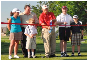
Pinnacle Country Club 3 Clubhouse Dr., Rogers