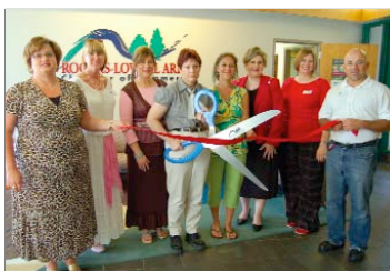
The Vintage Scarf Bella Vista