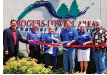
Brandon Williams Memorial Foundation Rogers