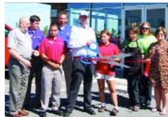
Quiznos of Lowell 225 N. Bloomington St., Lowell