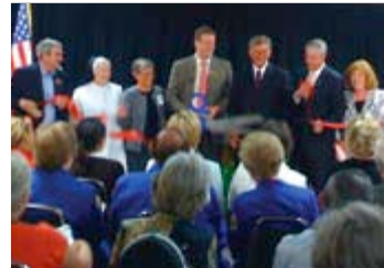
Center for Nonprofits at St. Mary's 1200 W. Walnut St., Rogers