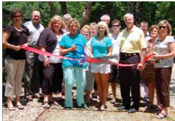
Caring Compressions 5 Halsted Cir., Rogers