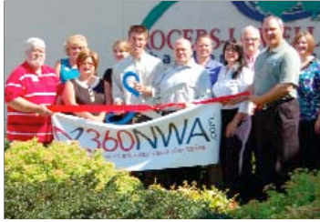
360NVA.com 125 W. Central Ave., Bentonville