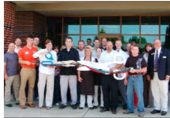
Catering Concepts 3200 SW Regency Pkwy., Bentonville