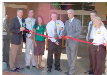
WalMart Neighborhood Market 5000 Whitaker Pkwy., Rogers