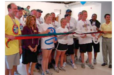
Pagnozzi Charities 26 W. Center St., Fayetteville